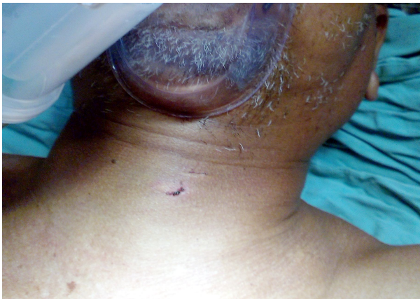
Fig. 1: Clinical picture showing entry point on left anterior part and swelling in the neck

well with the tip of the scissor. As the impacted object was metallic in nature, contrast enhanced computed tomography (CECT) scan of the neck was done which revealed a hyper-intense shadow of about 2x1cm size embedded into C5 cervical vertebra (Figure 3). The foreign body was not breaching any vital structures in the neck. So, we planned for transverse cervical approach under general anaesthesia to remove the foreign body. Intra-operatively, there was lot of edema in the soft tissues and it was difficult to identify the planes. Hence, we took the help of C-arm to see the depth and trajectory of the foreign body (Figure 4). Foreign body was localized to the undersurface of pharynx impacted in the C5 vertebra after doing extensive dissection alongwith frequent finger palpation. The alar fascia was incised to expose the foreign body adequately which was then removed with an allis forceps (Figure 5). Prophylactic tracheostomy was done intraoperatively as patient had lot of subcutaneous emphysema in the neck. Patient did not have complications post-operatively and he was discharged after decannulation after 7 days.