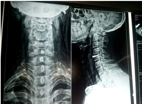
Fig. 2: X-ray (AP and lateral view) showing foreign body embedded in C5 vertebra