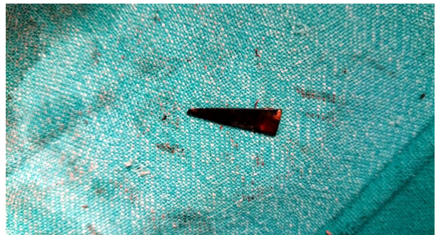
Fig. 5: Picture showing foreign body taken out after surgery