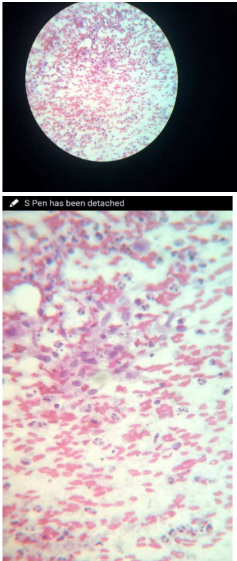
Fig. 4 and 5: Smear stained with PAP stain shows epithelioid cells in the vicinity of acute inflammatory exudate showing tubercular suppuration

TB therapy was started with a standard regimen and showed an excellent response with no mass or abscess reported on ultrasound examination after the course of treatment.