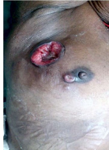
Fig. 6: Right breast showing fullness with ulcer and sinus.

A provisional diagnosis of TB was made and a standard anti-TB drug regimen of isoniazid,