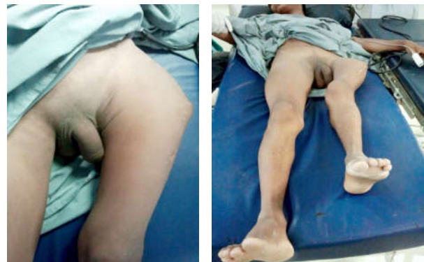
Fig. 2: Preoperative clinical photographs