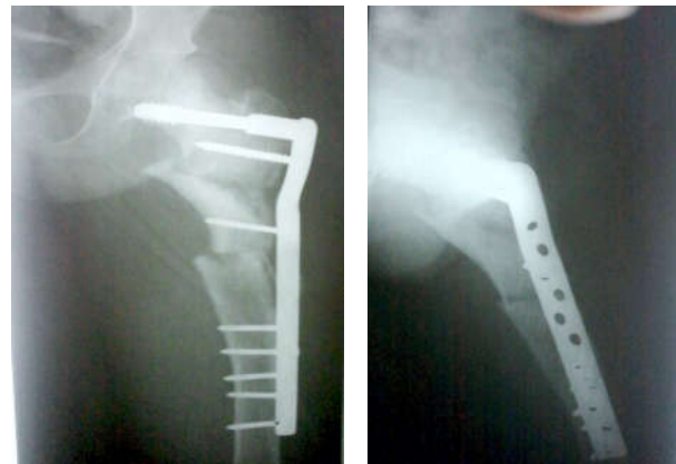
Fig. 3: Post operative radiographs