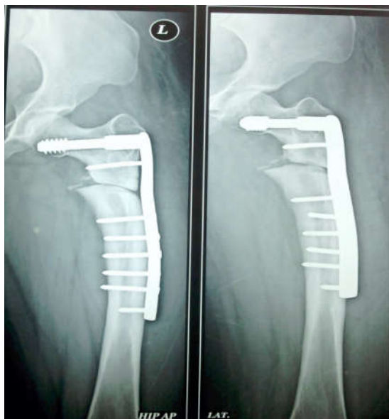
Fig. 7: Post operative radiograph case 2