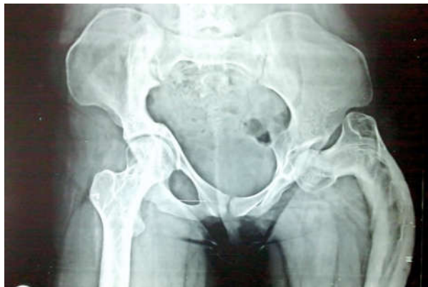
Fig. 6: Preoperative radiograph case 2