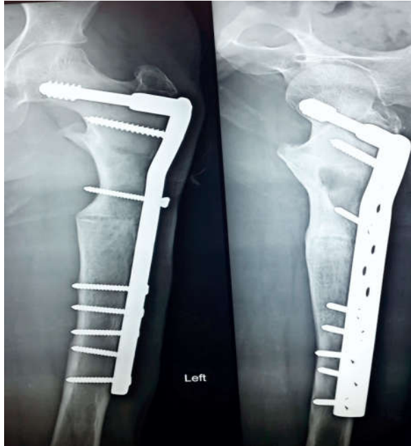
Fig. 5: Post operative radiograph at 14 months follow up