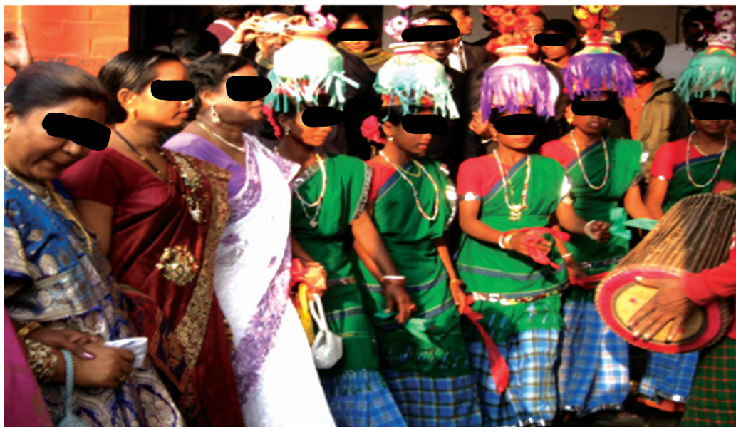
Figure 6: Santhals in Baha Festival (BAJSS Museum, New Delhi)

paintings. They do paintings using primary colors, riddled with leafy patterns in the foreground, background and borders. The Santhal paintings are marked by a directness and innocent simplicity in the depiction of birds, animals and insects. In Birbhum district, Santhals have a unique historical past of artwork and craft. In the village, there are cottage industries, amongst which potteries, wood works and dress material are remarkable. Some in their conventional crafts and paintings have scarcely been changed nowadays under the effect of modernization. It has been explored that most effective 17.5% of the villagers exercise their conventional artwork & craft, and as a whole lot