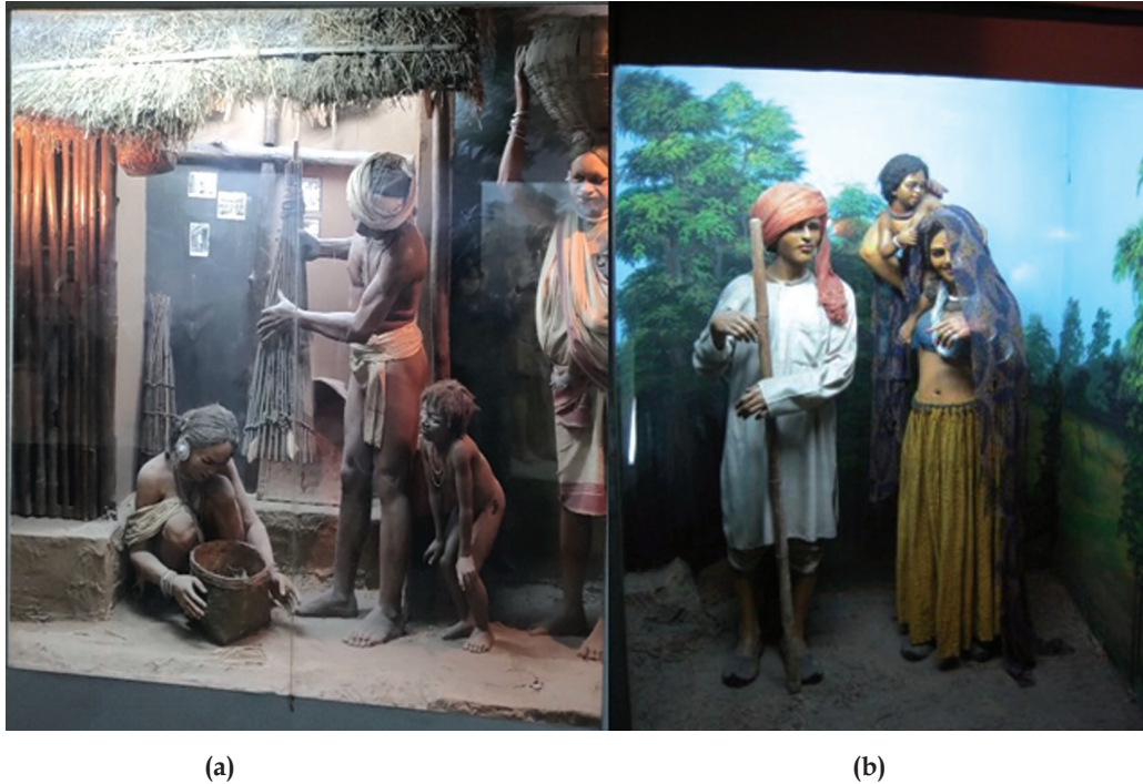
Figure 3: Bhil Tribe (BAJSS Museum, New Delhi)

noted by Verma. 7 He studied various aspects of tribal life cycle of Bhils, including pregnancy and childbirth, puberty, widow remarriage, the role of women in society, religion, village councils, and