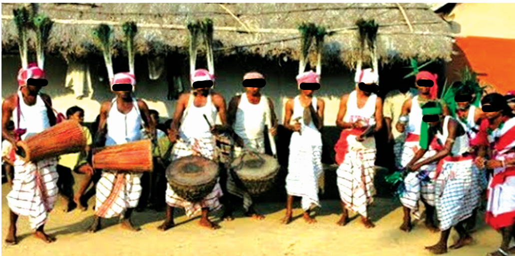
Figure 5: Lifestyle of Santhals (BAJSS Museum, New Delhi)

The Santhals smoke tobacco and drink mahua and tadi liquor and date palm juice to propitiate their Gods and Goddesses. They also offer the mahua fruit, wildflowers, and give up results to the jaher deities. Festivals of Karma and Makar Sankranti are celebrated with pomp and ceremony for prosperity and happiness. Magh-sim determines that the month of Magha (January February) marks the surrender of the year. Sahara, the cattle festival celebrated in November, is one of the leading essential fairs of the Santhals. Dancing is only one activity in their lifestyle they possess in their blood. Hence, Santhals love dancing and singing to enjoy and they are well