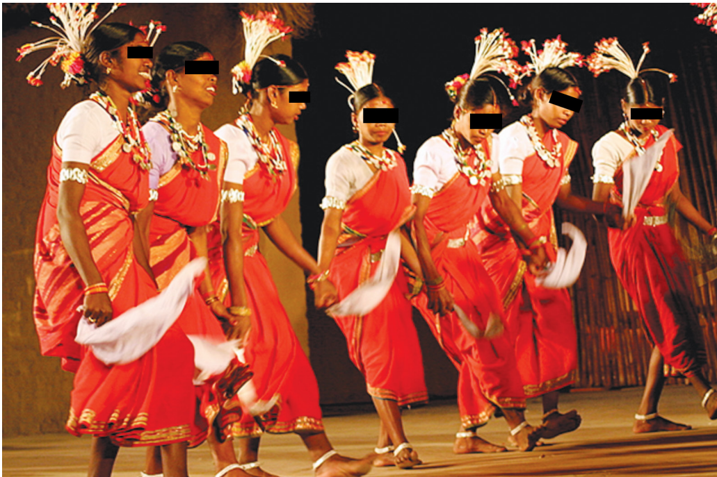
Figure 1: Gond Women’s Dance (Craft Museum, New Delhi)

Dances retell events from Gond mythology in