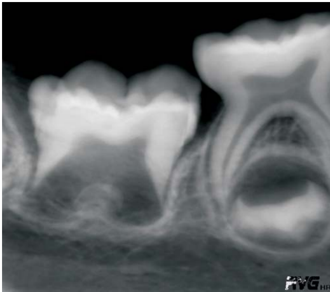
Fig. n.1: first lower left and right molars of MED40.39 ("Child with red jacket"): enamel irregularities on the crowns (moruliform teeth)