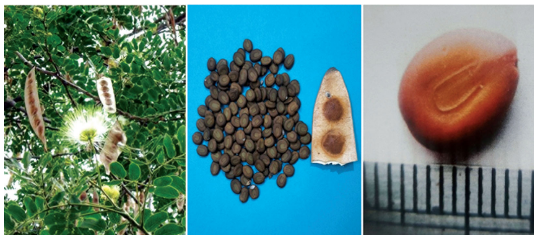
Fig. 1a: Albizia lebbeck, Fig. 1b: Seeds of A. lebbeck, Fig. 1c: Germination of A. lebbeck

percentage of seed germination noted in Albizia lebbeck and Bauhinia variegata.