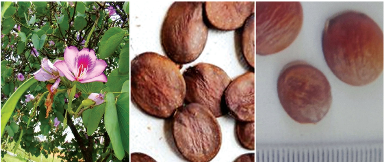
Fig. 3a: Bauhinia variegata, Fig. 3b) Seeds of B.variegata, Fig. 3c) Germination B.variegata