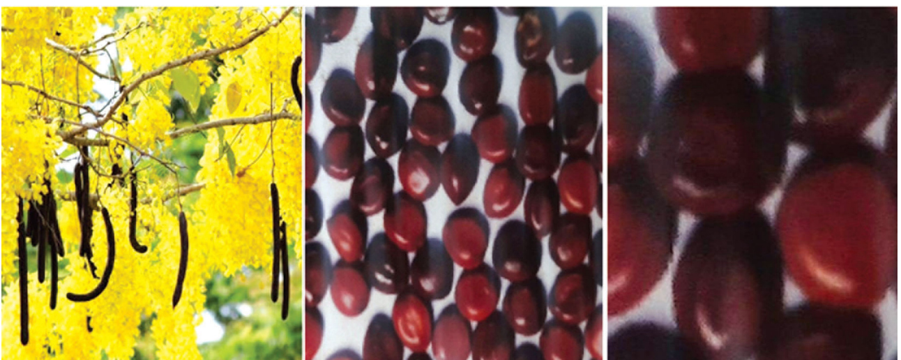
Fig. 4a: Cassia fistula, Fig. 4b) Seeds of C. fistula, Fig. 4c) Germination C. fistula