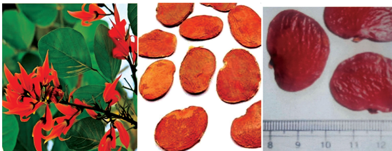
Fig. 5a: Butea monosperma , Fig. 5b) Seeds of B. monosperma , Fig. 5c) Germination B. monosperma