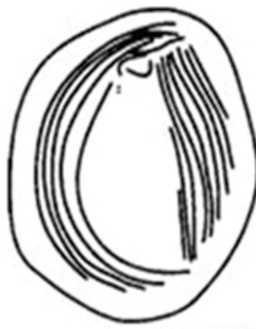
Fig. 1: (b) Line diagram of Chilodonella hexasticha